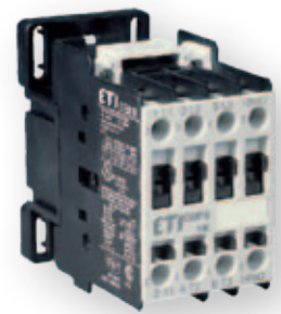
Pomoćni blok na stranici 188