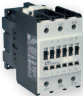
Pomoćni blok na stranici188